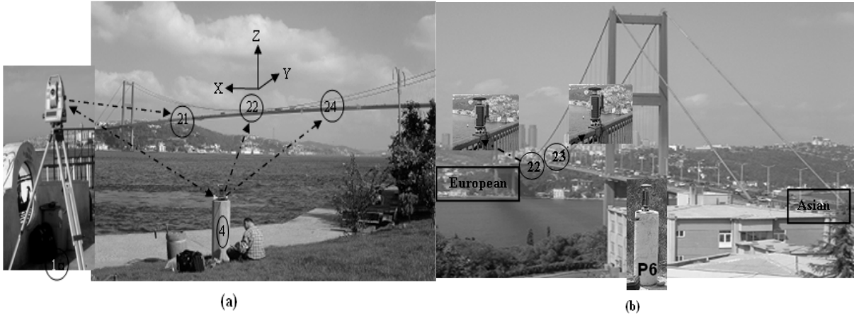
Fig.1 The Bosphorus Bridge, stations, instrumentations setup for Total Station (a) and GPS (b) measurements

GPS measurements at 22 and 23 stations were made at the same time and sampling frequency is 5 Hz. For each station, the measurements were recorded for 60.9 minutes at intervals of 0.2 second (5Hz), which resulted in a total of 18045 measurement points (Fig. 1b). During all measurements, normal traffic was allowed to flow over the bridge at normal speeds. Measurements were shown in Fig.2.